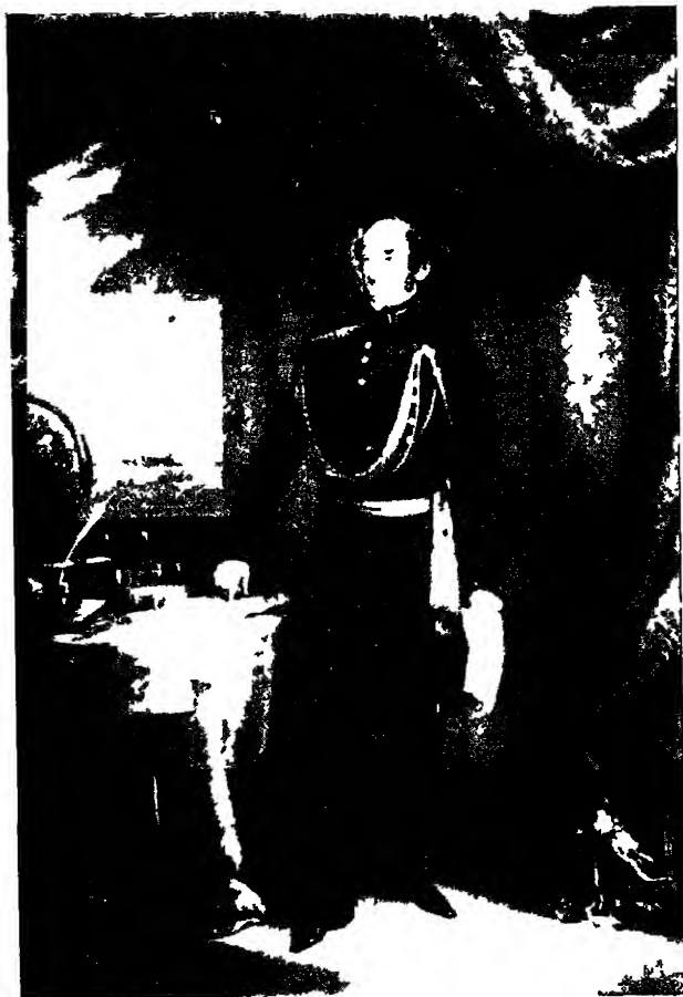
GENERAL SIR MARK CUBBON, K C B

Born at Kirk Maughold Vicarage, Isle of Man, 1775